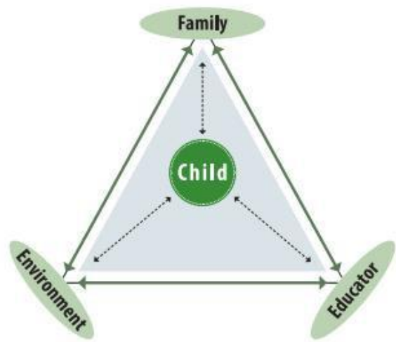
(Ontario Ministry of Education, 2014, p. 6)

The University of Guelph Child Care and Learning Centre (CCLC) proudly delivers an inclusive, child-centred, family-oriented program based on a philosophy of children as competent, capable, curious participants and contributors in their environments, their families and their communities and so very rich in potential. We are committed to supporting families and children to reach their potential through developing relationships built on respect and providing an environment that supports positive and responsive interactions. This begins with relationships among staff, students and volunteers and ripples out to relationships with children, families and the community.